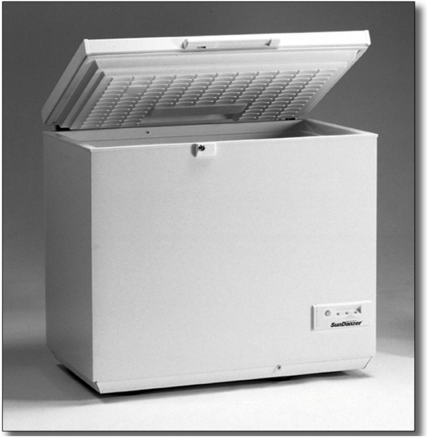
SunDanzer<sup>™</sup> units are manufactured in a highly automated factory by one of the worlds leading appliance manufacturers to SunDanzer's stringent standards for quality and efficiency.